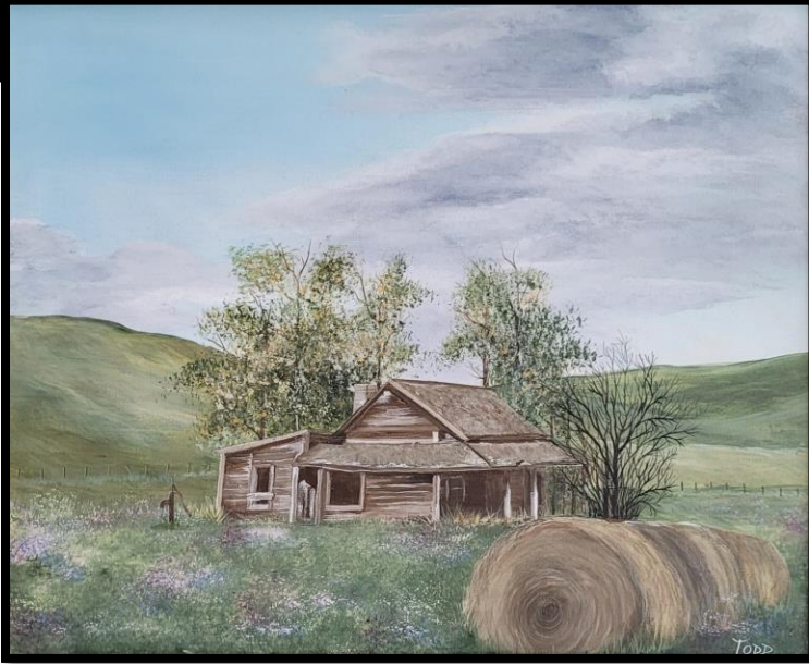
Barb Todd , Donalda

Along with her exquisite acrylic landscapes, Barb shared a number of hand-crafted native beaded and leather creations from the Todd's local business, Buffalo Lake Creations , including her beautiful dream catchers!