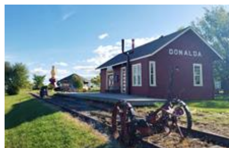
CN Railway Station

“The Donalda and District Museum is dedicated to the purpose of preservation, conservation, interpretation, and exhibition of object of educational and cultural value. “