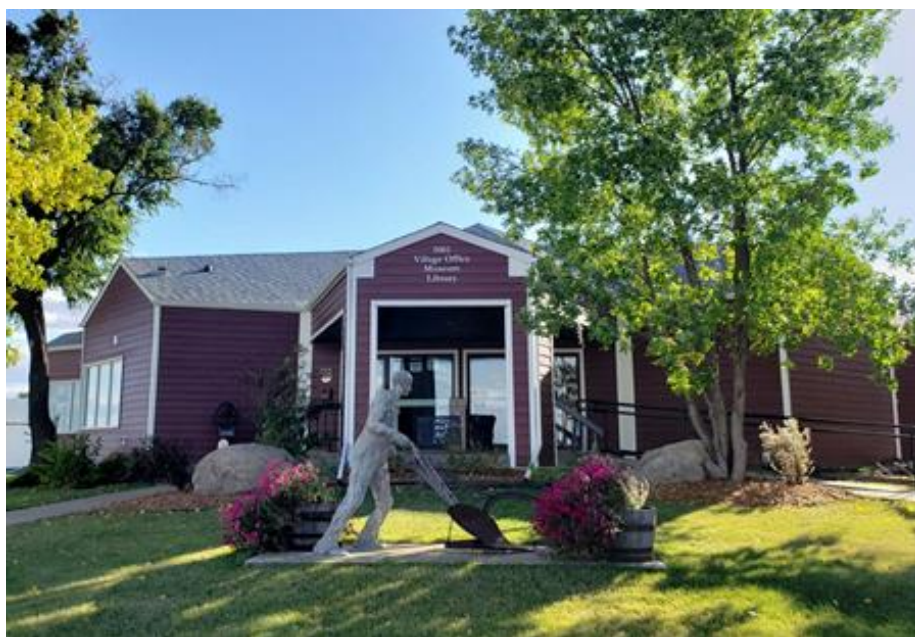
New Exterior of the Donalda Museum and Village (Completed 2021)

Welcome to the annual edition of the Donalda Freelance, a newsletter that was published in Donalda around the time of First World War. Now it is used as a means for the Museum to communicate its activities and plans to the community members and visitors as well.