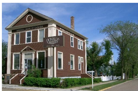
Imperial Bank of Canada Building